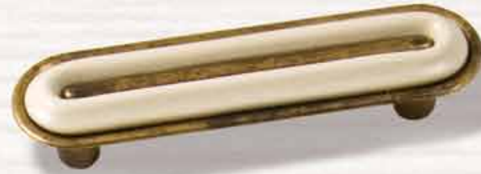
18.300 Fin. 02