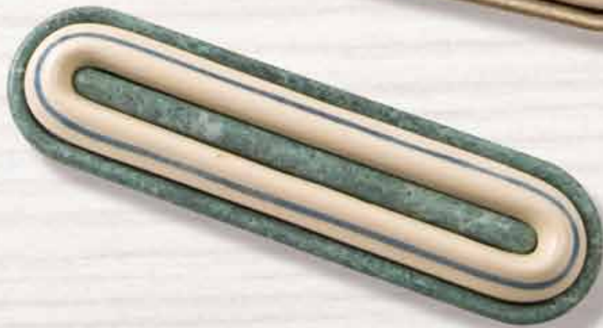
18.300 Fin. 26