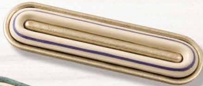
18.300 Fin. 09