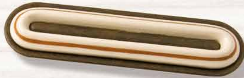
18.300 Fin. 21