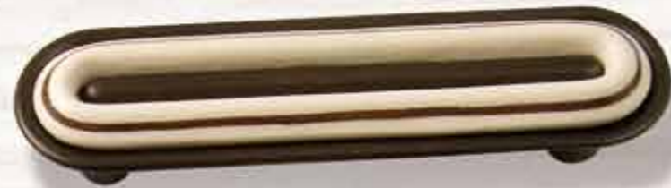
18.300 Fin. 31